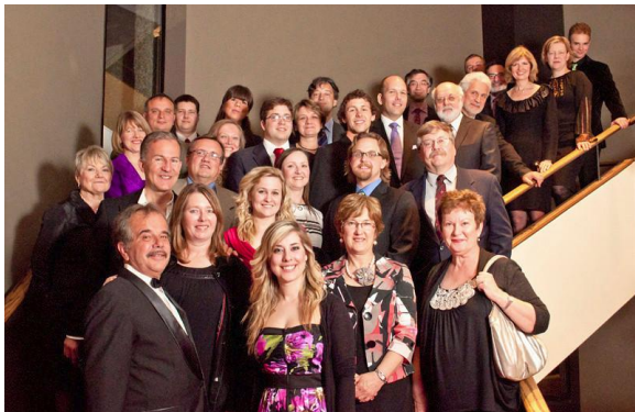
Various SUSK delegates and Alumni