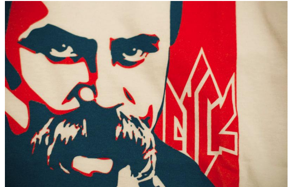
SUSK limited edition T-Shirts "Nadia" / "Hope"