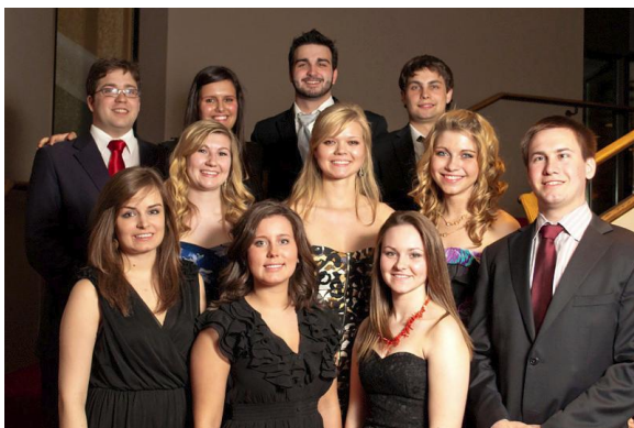
Members of the 2011/2012 SUSK Executive