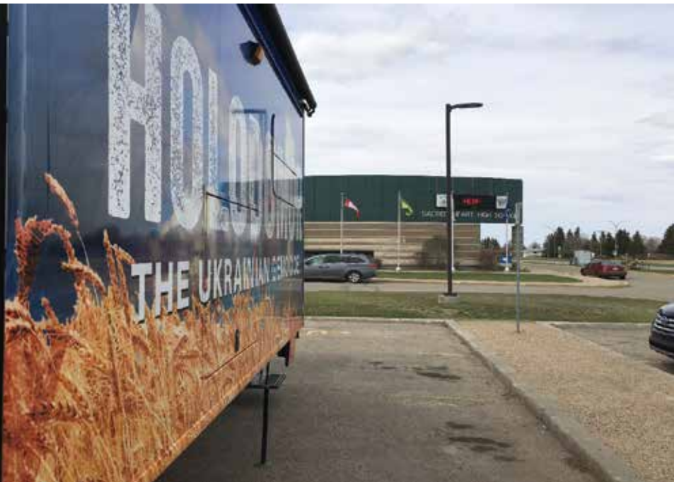
The Holodomor Mobile Classroom across from Sacred Heart High School in Yorkton, May 2019